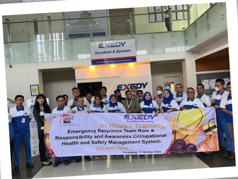
PT. Exedy Manufacturing Indonesia Quality, Environmental, Health & Safety and Automotive Awareness & Auditor