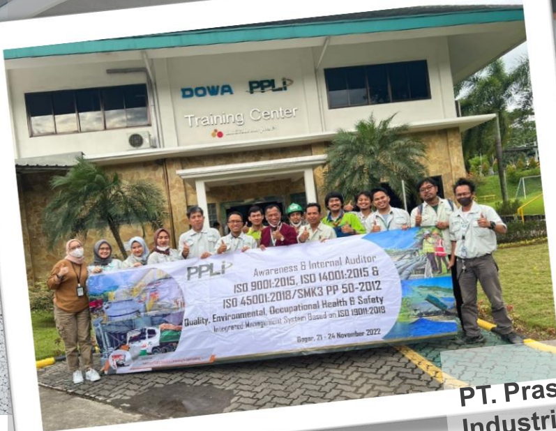
PT. Prasadha Pamuloh Limbah Industri (PPLI) Quality, Environmental, Health & Safety, SMK3 Awareness & Auditor