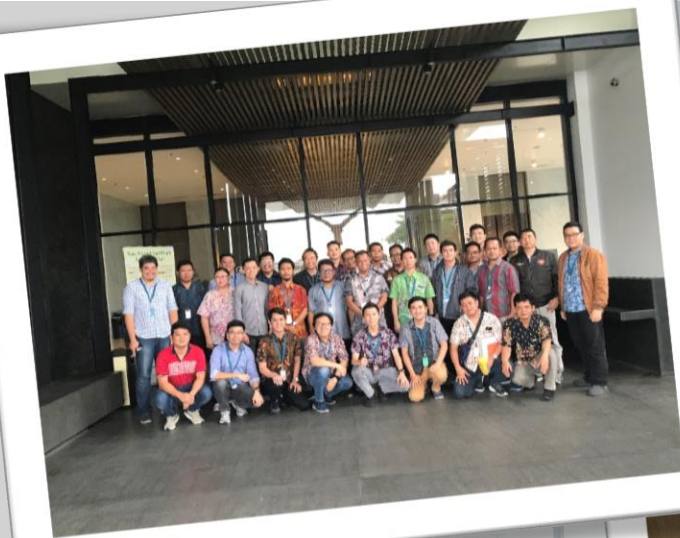
PT. Djarum Kudus Quality, Environmental & SMK3 Awareness & Auditor