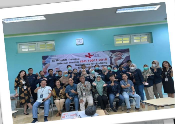
PT. Bukit Asam Medika (Hospital) Quality & Balanced Scorecard Awareness & Auditor