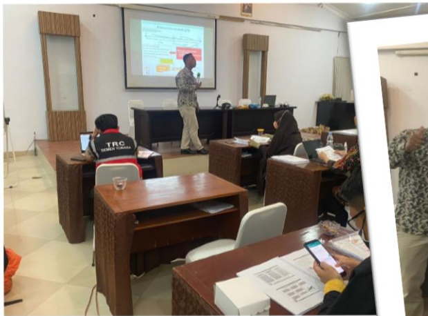
PT. Semen Tonasa (Semen Indonesia Group) QHSE, SMK3 & SMK3 Awareness & Auditor