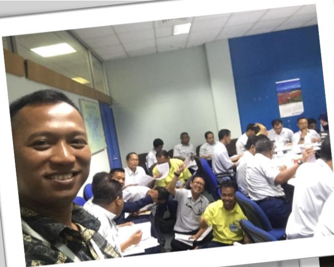
PT. Sumitomo Wiring System Batam Quality & Automotive Standard Awareness & Auditor