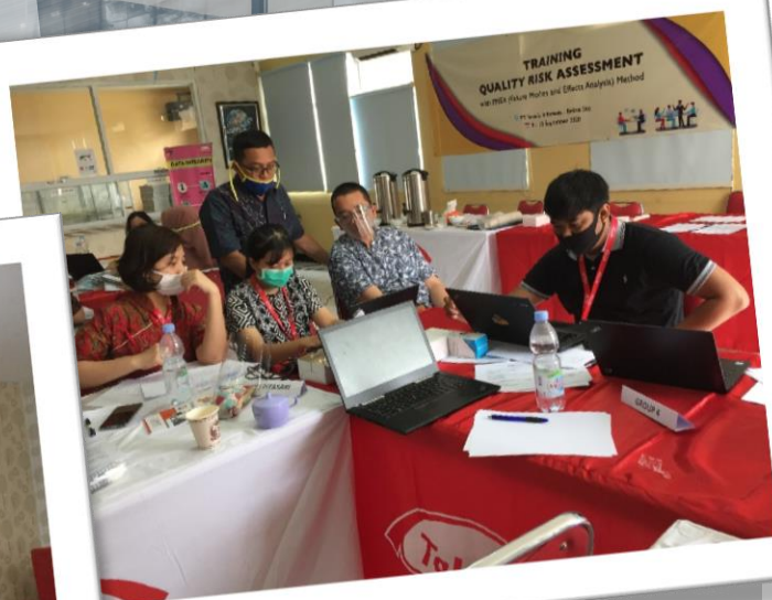
PT. Takeda Indonesia Quality & FMEA (Failure Risk Assessment) Awareness