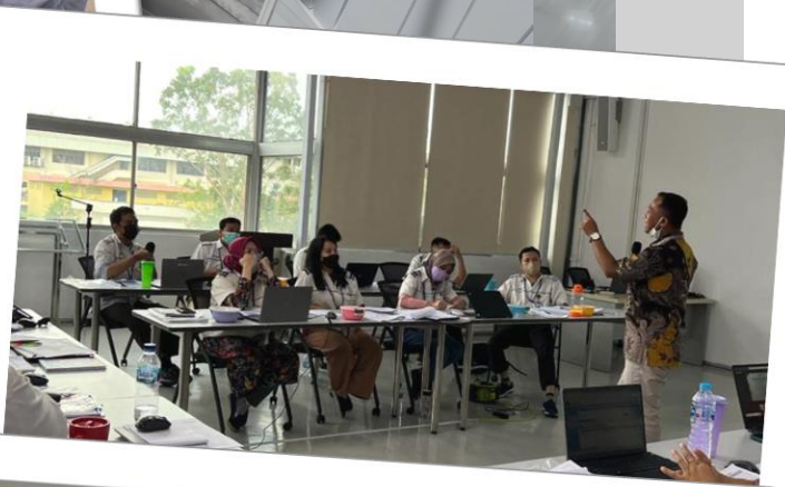
PT. Epson Batam Quality, Environmental, Health and Safety Awareness & Auditor