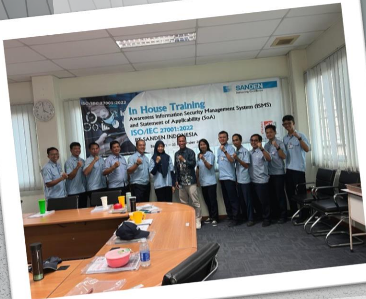
PT. Sanden Indonesia IATF Automotive, HSE, Information Security