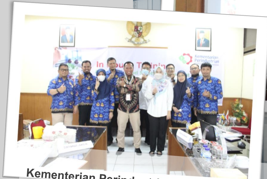
Kementerian Perindustrian (BBPK, Baristan Banjarbaru, Pontianak, etc) Quality, Testing and calibration laboratories Awareness & Auditor