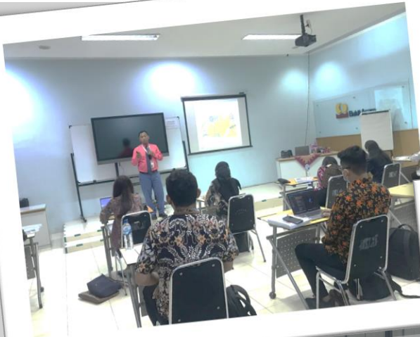
PT. Bukit Asam, Tbk Quality, Environmental, Health & Safety, SMK3 Awareness & Auditor