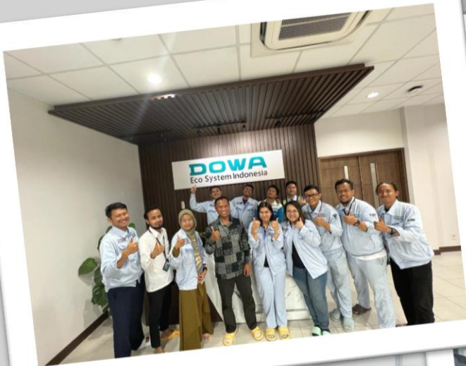
PT. Dowa Eco System Indonesia QHSE, Testing & Calibration Laboratories