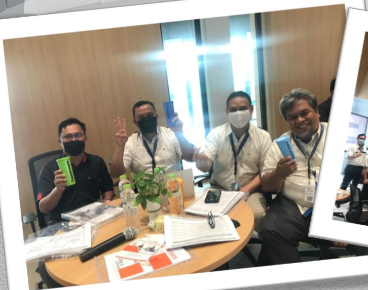
PT. Bukit Muria Jaya Quality, Environmental, Health & Safety and SMK3 Awareness & Auditor